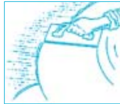
Steel float finish