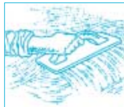
Wood float finish