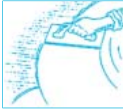
Steel float finish