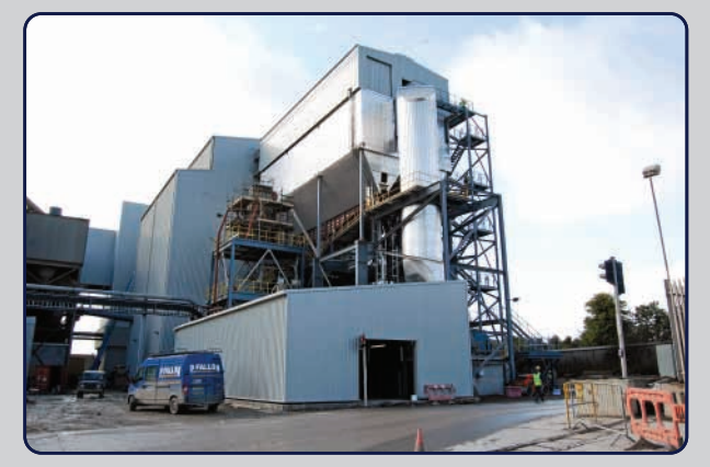
Kiln 3 in Platin will operate to world-class emission standards because of the installation of state-of-the-art bag filters. The bag filter seen here is part of our new energy efficient cement mill 4.