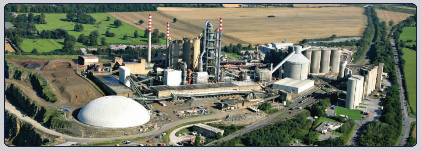
A recent aerial photograph of Platin as the Kiln 3 project nears completion.