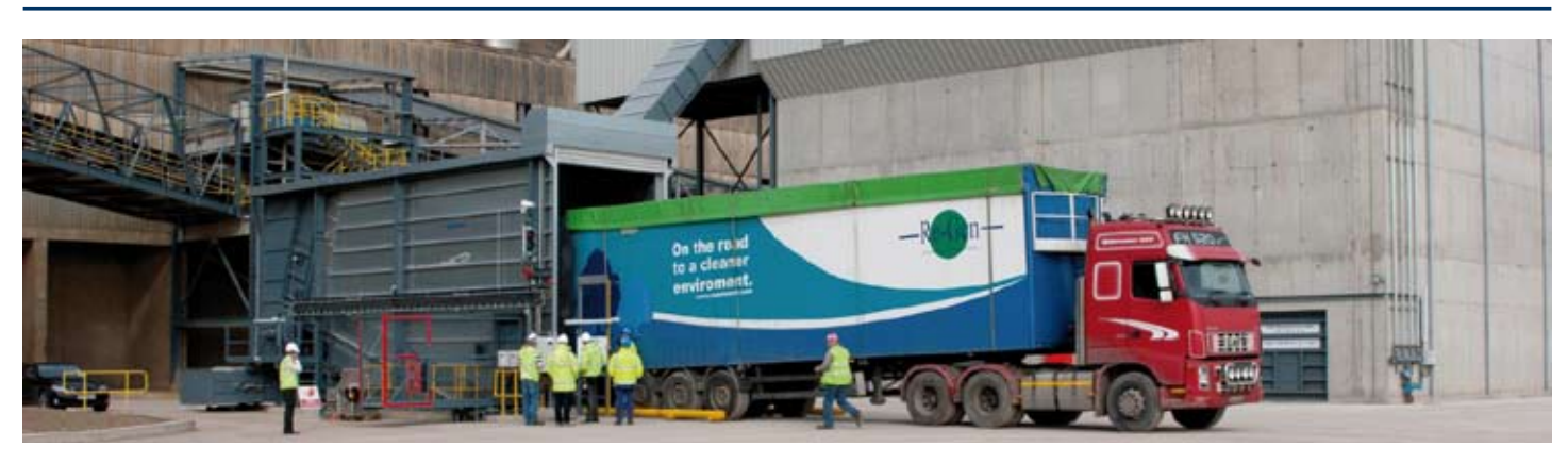
The new truck unloading dock for the alternative fuel store at Platin, receiving its first load of SRF.

Yours sincerely, Pat Creagh, Platin Works Manager Telephone 041 9876000